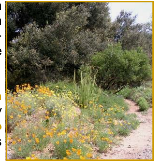
Beautiful native and California Friendly plants can save 30-60 gallons per day per 1,000 square feet

The good news is, you CAN help by taking on the 20-Gallon Challenge! If every person can save 20 gallons of water a day that will significantly help the region by allowing more water to stay in storage to meet future demands. And saving water is easier than you might think. A few simple changes can make a big difference in your water usage.