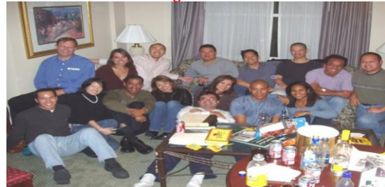
Picture of OBL staffs & adoptees at their Reunion

The OBL community consists of aircrew, caretakers, nurses, medical technicians, adoptive parents and adoptees. These war orphans and living survivors began their annual reunions in 2000. Endorsed by the Ford foundation, this year Torch 1975 Inc and VFW Post 9934 have the honor to host this OBL event. 2013 has more special impact as it is also the Centennial Birthday celebration for President Ford - the author of OBL. Torch 1975 and VFW Post 9934 are really looking forward to welcome the Vietnamese American babies that were rescued almost four decades ago.